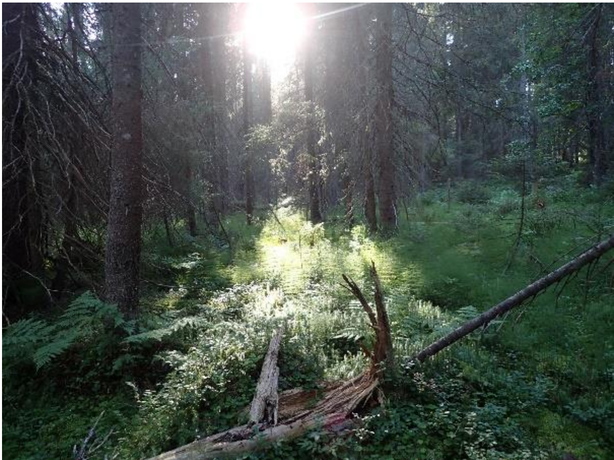
Figure 2: The surroundings of the sampling site downhill from Finnerudseter.

The core sample site was located in flat terrain, downhill from Finnerudseter, c. 50 m from the meadow (open vegetation) and c. 504 m.a.s.l. (N60°09.064' E010° 32.072'). There is a ditch 10 m east from the site; which comes from earlier forestry. In the 1940s, ditching of mires and wet forests was common to increase the amount of forest producing area (G. Andersen, personal communication 2015). The forest is dominated by 40-80 years old Picea . The area constitutes of swampy soils with species such as Sphagnum sp., Mnium sp. (in the wetter areas with inflow/outflow water), Equisetum sylvaticum L., Lycopodium annotinum L. (in the drier and raised areas), various species of Filicateae and Vaccinium myrtillus L.. The soil cover was thin in some places, with presence of some sandy soils. The hollow where the core was taken was a small swampy depression (c. 1 m 2 ) dominated by Sphagnum -mosses (Figure 2; Figure 3).