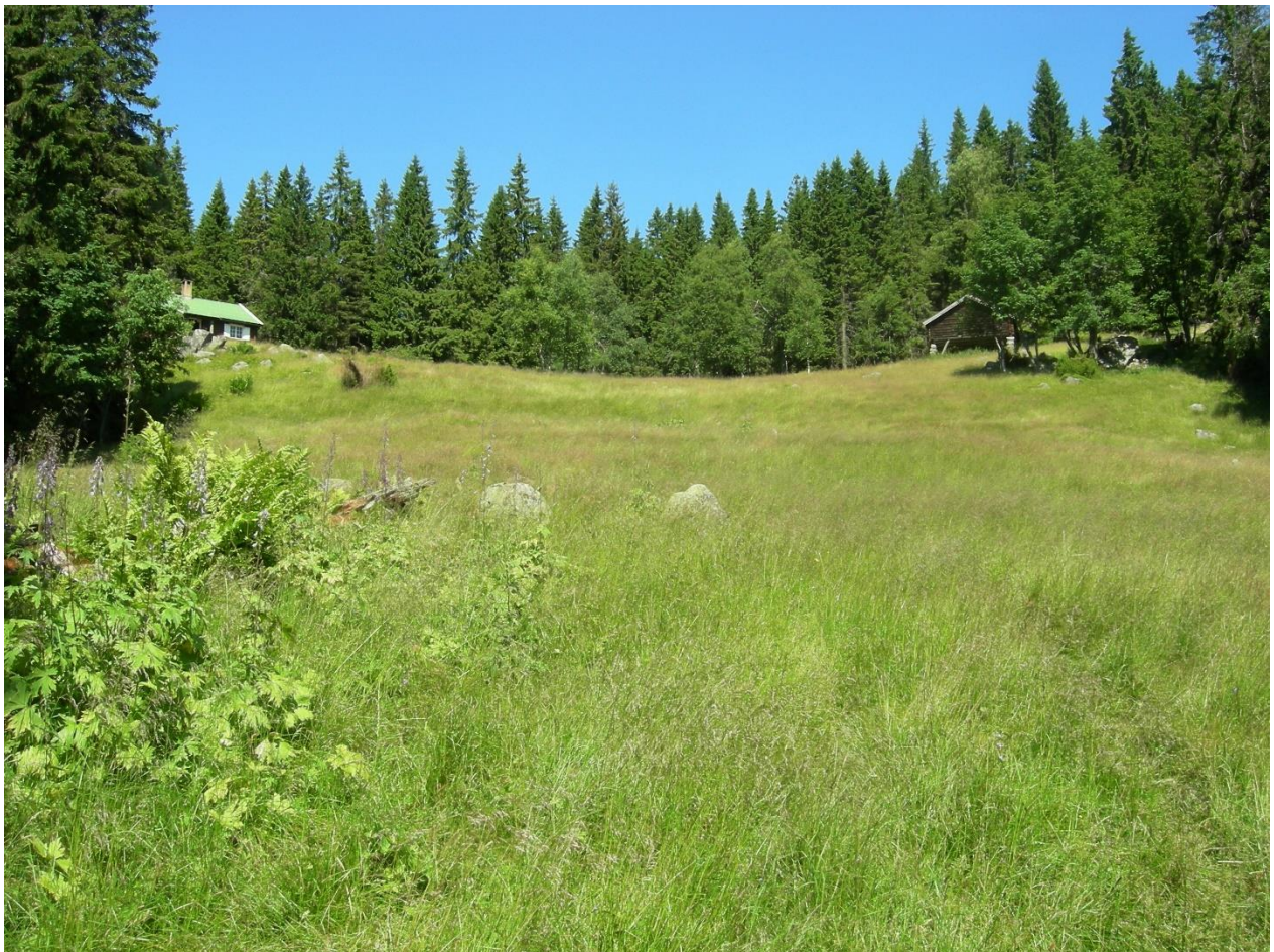
The summer farm Finnerudseter