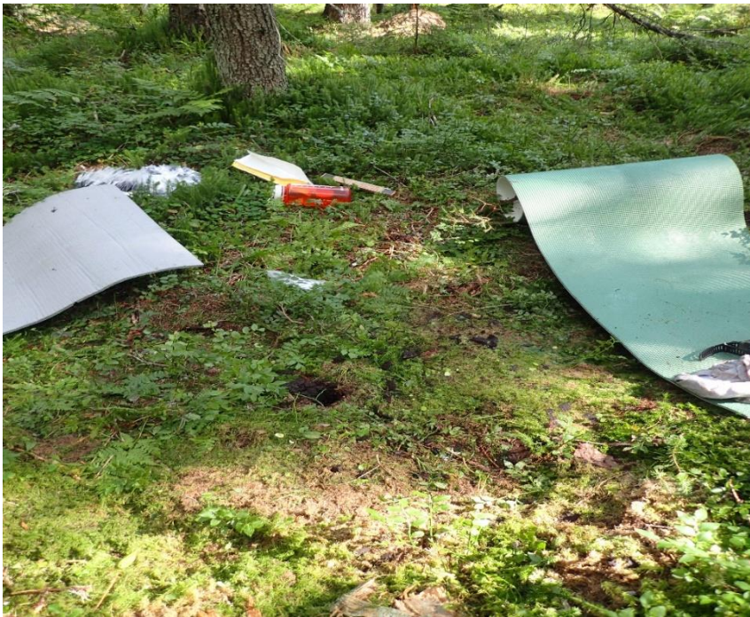
Figure 3: The sampling site.

Peat cores were taken in the end of August 2015 with a Russian corer (Jowsey 1966) of 5 cm in diameter and 50 cm in length. Total length of the peat cores was 149 cm. The first 4 cm were cut with a knife. Each core of 50 cm were cut in 1cm thick slices in the field and put in plastic zip-lock bags right away. The plastic bags were marked with a sample number and how many cm below the surface the sample derived from. The samples were stored in a refrigerator with 4-5 °C until preparation and analysis. Vegetation types were classified with Fremstad (2007) and vascular plant names follow nomenclature by Lid et al. (2005).