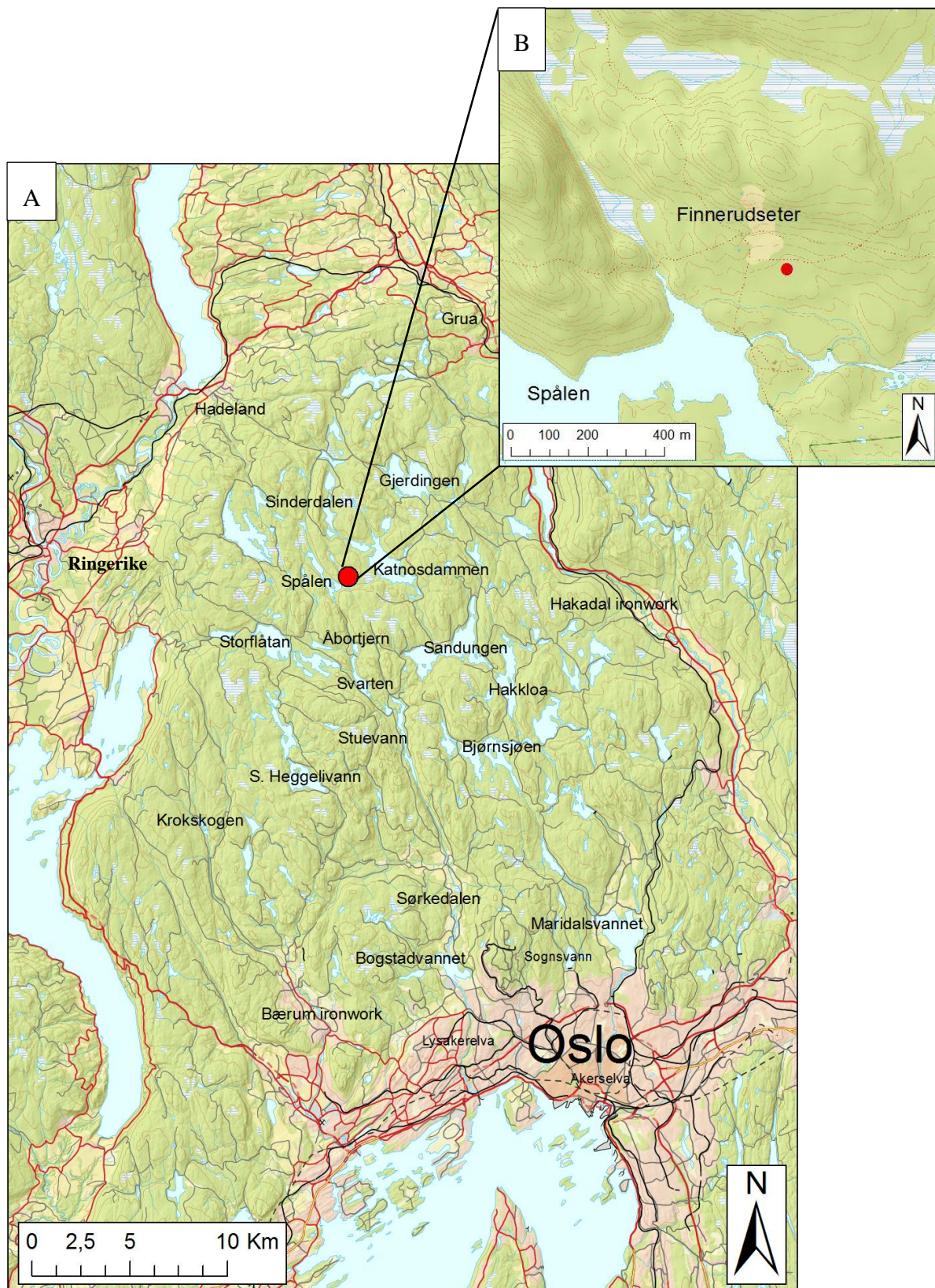
Figure 1: Map showing the forests of Nordmarka in relation to Oslo and location of the sampling site (A), and the sampling site at Finnerudseter (B).